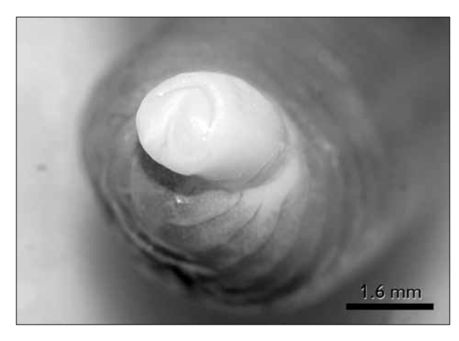
Figure 2. Holotype of Microcaecilia trombetas sp. nov. (MPEG 26476). Detail extended phallodeum.

(only on left side) secondary annular groove posterior to the level of the posterior margin of the vent. Vent with twelve denticulations: six on the anterior and six on the posterior margin. Dermal scales starting at 8th annular groove, with at most four rows per body annulus. Scales at 8th primary groove small and narrow, (0.2 \times 0.4 \text{ mm}) ; larger posteriorly (e.g. 0.7 x 0.9 mm at 100th primary annulus). Choanae circular, due to the preservation it was not possible to measure them. Tongue anteriorly attached to the mandibular mucosa, no narial plugs on tongue. Premaxillary-maxillary teeth 17, with little variation in size, posterior maxillary teeth smaller. Premaxillary-maxillary series extending posteriorly to beyond the level of the posterior margin of the choanae. Vomeropalatine teeth 21, monocuspid, with no apparent variation in size; teeth smaller than in all other series. Dentary teeth 15, slightly larger than premaxillary-maxillary teeth; size of teeth decreasing posteriorly. More data in Table 1.