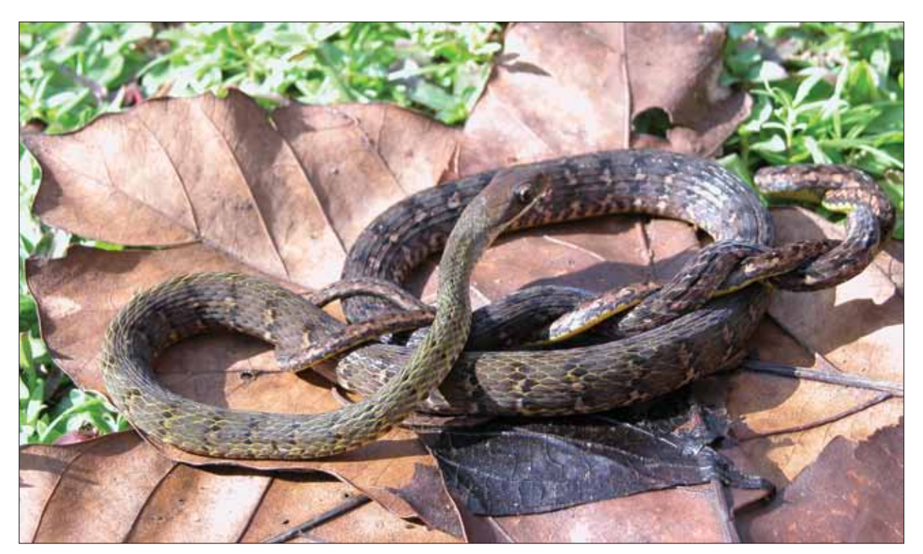
Figure 2. Dendrophidion dendrophis (MPEG 21140, Monte Dourado, Pará, Brazil) with tightly twisted tail and posterior part of body, just before autotomizing part of the tail.

The material was collected under collecting permits of the Ministério do Meio Ambiente issued by the Instituto Brasileiro do Meio Ambiente e dos Recursos Naturais Renováveis (IBAMA) (MMA-IBAMA, license numbers 043/2004-COMON, 0079/2004-CGFAU/LIC, 127/2005 and 048/2005).