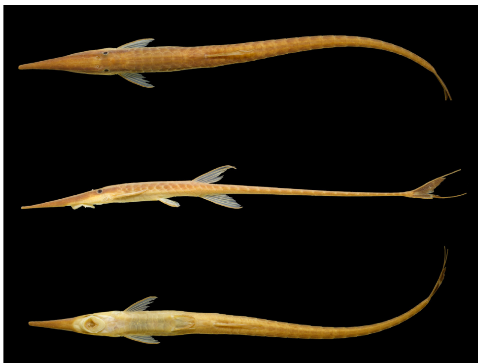
FIGURE 2 | Dorsal, lateral and ventral view of Farlowella wuyjugu , holotype, 143.4 mm SL, MPEG 26178, Brazil, Pará State, Juruti municipality, igarapé Rio Branco, lower rio Tapajós, rio Amazon basin.

Description. Dorsal, lateral, and ventral views of holotype in Fig. 2. Morphometric and meristic data for holotype and paratypes summarized in Tab. 1. Body slender and very elongated, completely covered by dermal plates, except in gular portion. Head triangular and elongate in dorsal and ventral views. Rostrum slender and flat in ventral view. Orbit circular, dorsolaterally placed, visible in dorsal view and not visible in ventral view. Preorbital ridge present. Mouth ventral. Dorsal profile of head concave from snout tip to anterior margin of nares, relatively straight to convex from point to posterior margin of nares to posterior margin of parieto-supraoccipital and slightly concave to dorsal-fin origin. Posterior profile of margin of dorsal-fin origin slightly concave and straight profile to end of caudal peduncle. Ventral profile slightly straight from tip of snout to anal-fin origin, slightly concave in anal-fin base and straight profile to end of caudal peduncle.