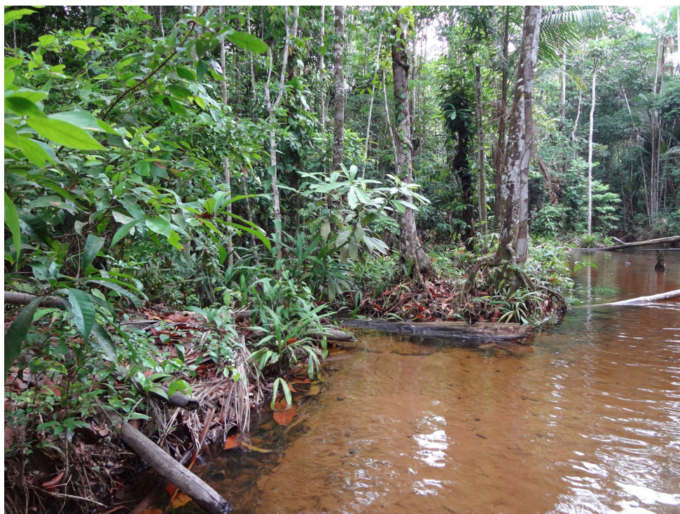
FIGURE 6 | Igarapé Rio Branco, type-locality of Farlowella wuyjugu .