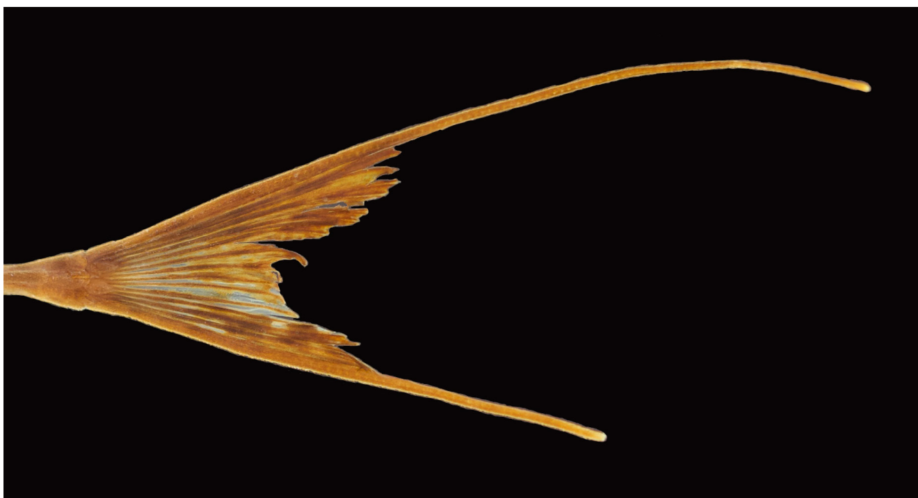
FIGURE 4 | Caudal fin coloration of Farlowella wuyjugu . MPEG 31191, 119.9 mm SL.