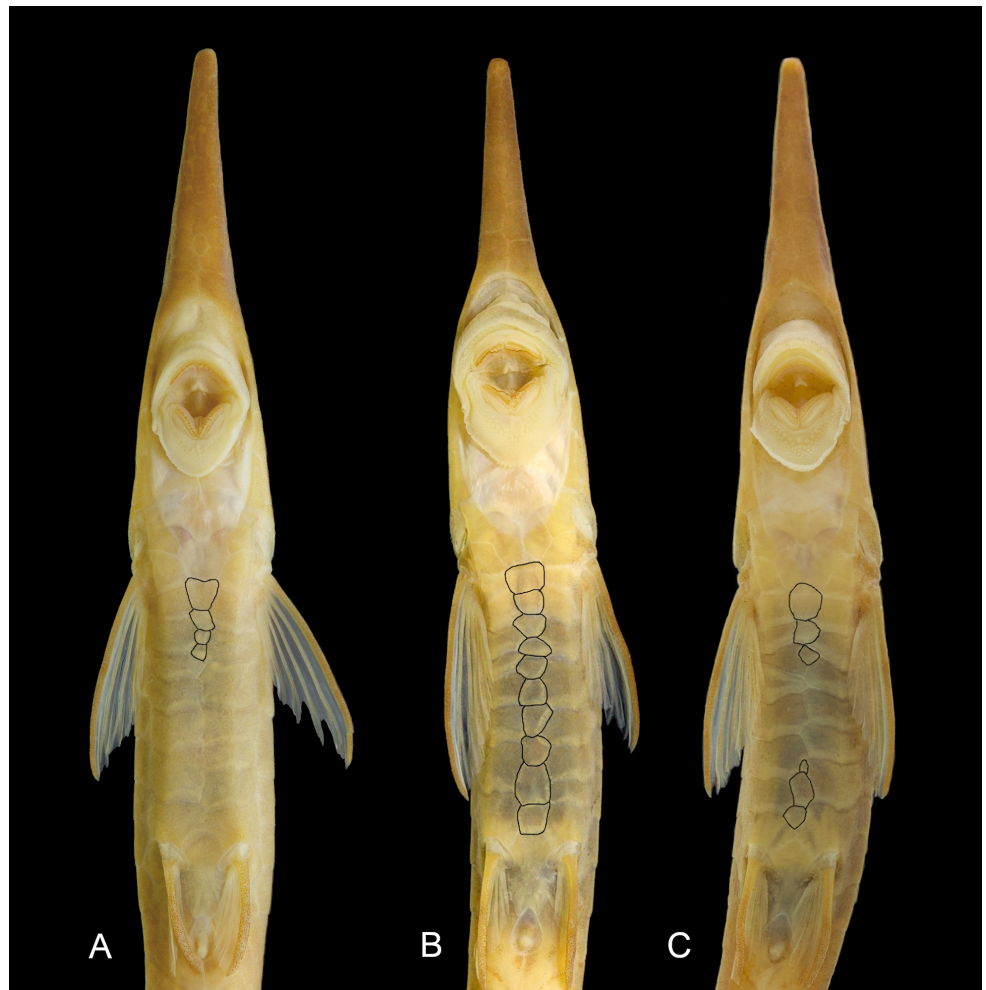
FIGURE 3 | Gular region and variation of abdominal plates in specimens, ventral view of Farlowella wuyjugu . A. MPEG 26178, 143.4 mm SL; B. INPA 59894, 128.9 mm SL; C. MPEG 12684, 125 mm SL.

straight, without anterior projection. Urohyal triangular and posterior margin rounded, with medial foramen. Anterohyal and posterohyal partially separated by cartilage. Anterior margin of anterohyal greatly expanded. Basibranchial 2, 3 and 4 present; basibranchial 2 and 3 elongated; basibranchial 2 equal to basibranchial 3; basibranchial 2 and 3 ossified and basibranchial 4 cartilaginous. Two hypobranchials; hypobranchial 1 ossified and hypobranchial 2 cartilaginous. Four epibranchials with similar size. Five ceratobranchials; ceratobranchial 1 with accessory flange; ceratobranchial 5 triangular; ceratobranchial teeth restricted to mesial area of plate. Upper pharyngeal plate club-shaped, completely covered with fine teeth. Vertebral count 39(1) and 40(1); five thin pleural ribs directly attached to centra 8, 9, 10, 11 and 12(1) and four thin pleural ribs directly attached to centra 9, 10, 11 and 12(1); parapophysis of complex vertebra well developed (two specimens).