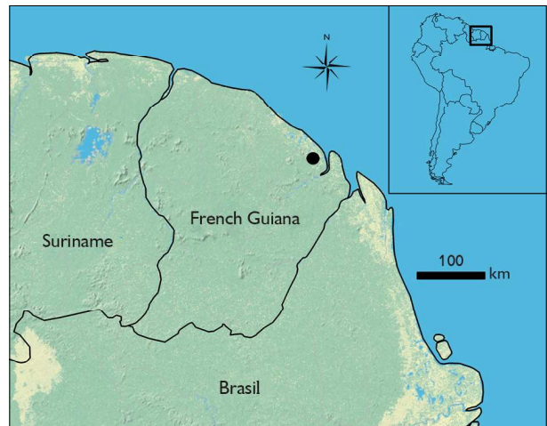
Figure 4. Map of eastern Guiana Shield. Type locality of Caecilia museugoeldi sp. nov. indicated by black dot.

The name of the species is in honor of the Museu Paraense Emílio Goeldi, Belém, Pará, Brazil and is a noun in apposition. The Museu Goeldi is an institution