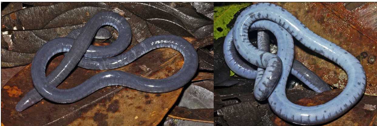
Figure 1. Holotype of Caecilia museugoeldi sp. nov. in life. Left, dorsal view of the body. Right, ventral view of the body.