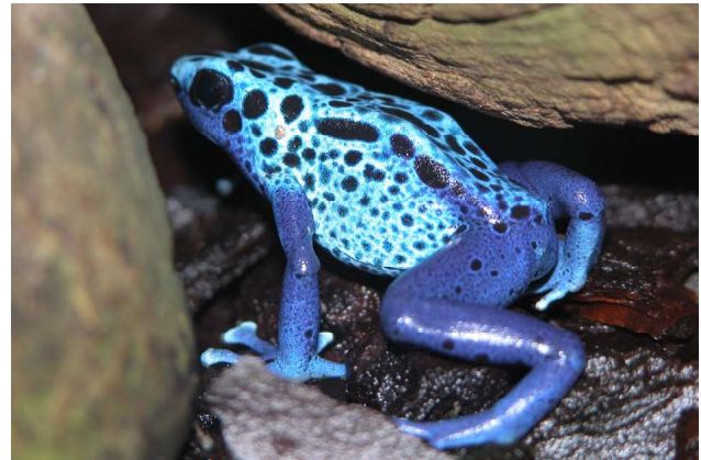
Fig. 1. Dendrobates “azureus” (= tinctorius ).

1968: Hoogmoed (1969a,b) discovered populations of D. “azureus” in four forest islands in the middle of the Sipaliwini savanna near the Vier Gebroeders Mountain