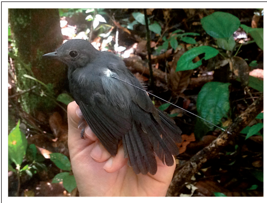
Figure 2. Male Cinereous Antshrike ( Thamnomanes caesius ) with 0.5 g radio telemetry transmitter glued to its back (photo credit F. C. B.).