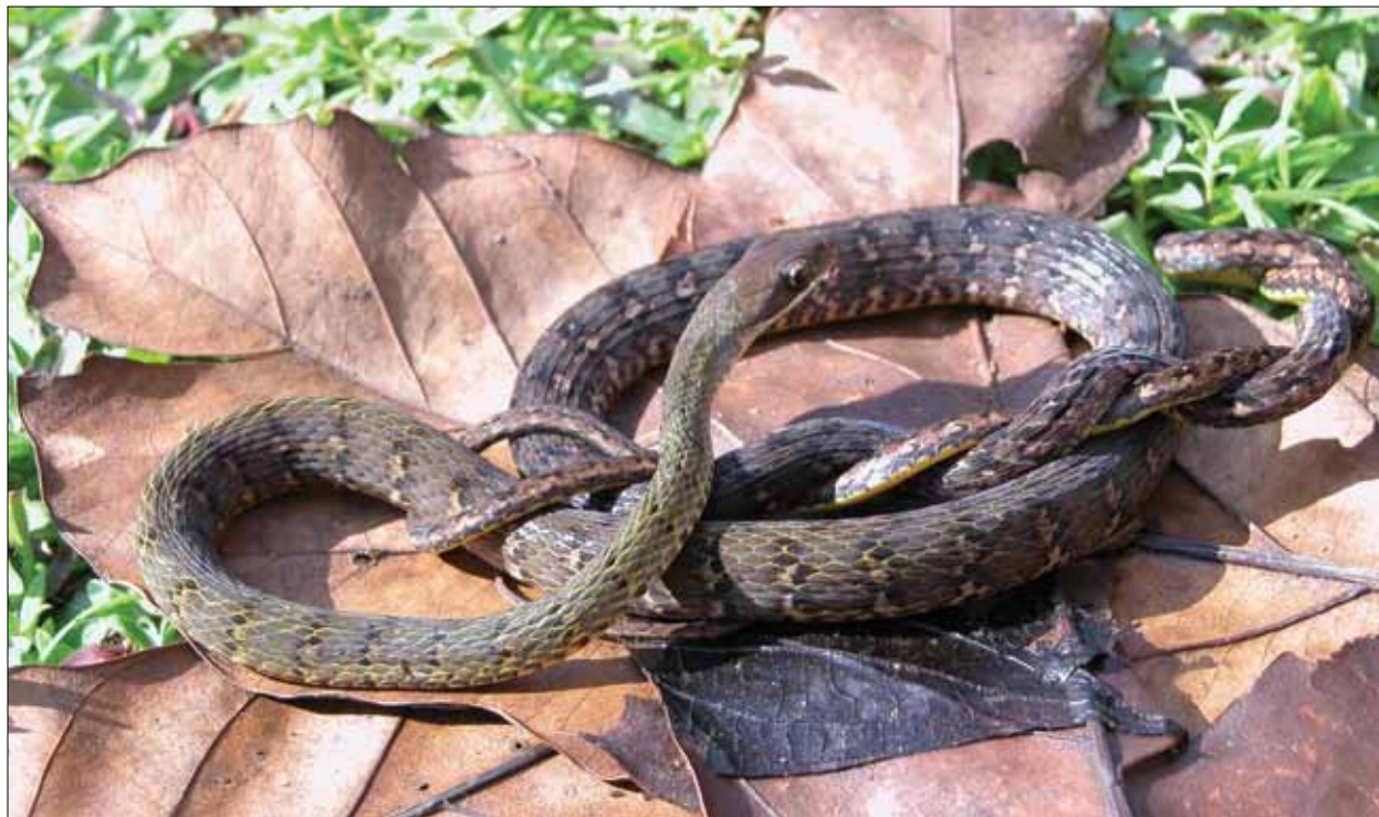
Figure 2. Dendrophidion dendrophis (MPEG 21140, Monte Dourado, Pará, Brazil) with tightly twisted tail and posterior part of body, just before autotomizing part of the tail.

The material was collected under collecting permits of the Ministério do Meio Ambiente issued by the Instituto Brasileiro do Meio Ambiente e dos Recursos Naturais Renováveis (IBAMA) (MMA-IBAMA, license numbers 043/2004-COMON, 0079/2004-CGFAU/LIC, 127/2005 and 048/2005).