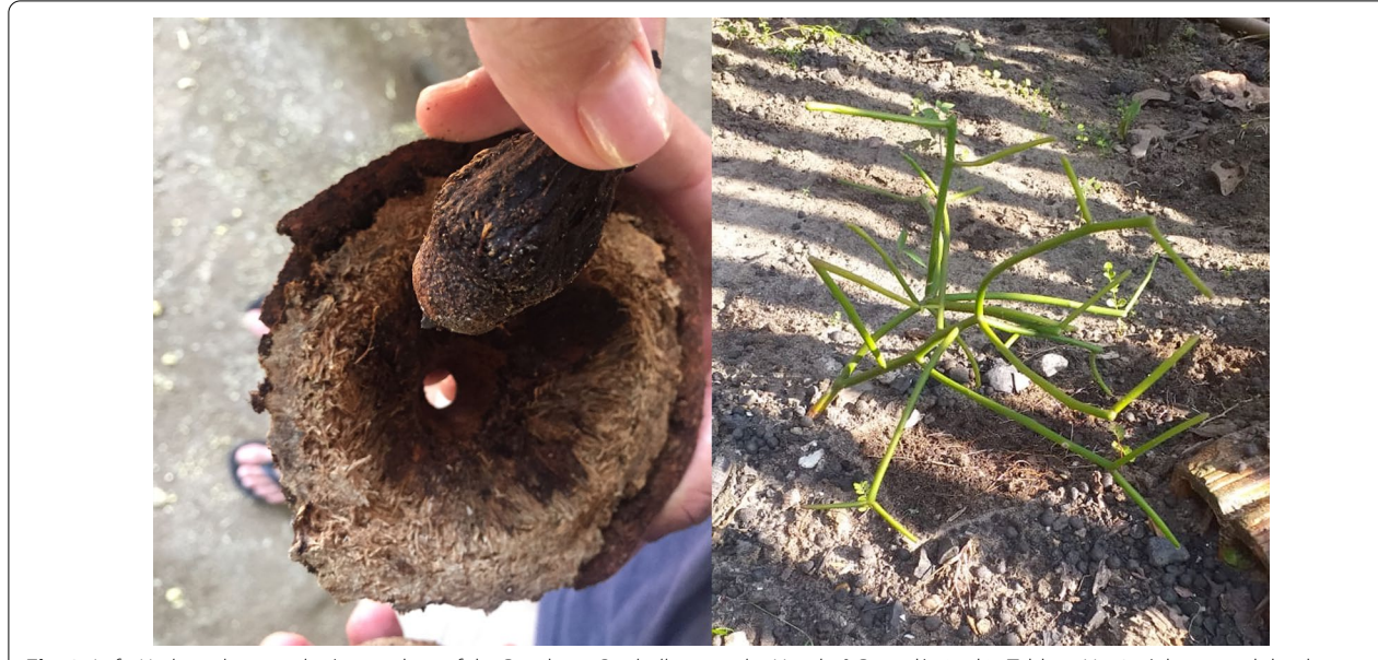
Fig. 3 Left: Umbigo da castanha (operculum of the Brazil nut; Bertholletia excelsa Humb. & Bompl.) cited in Table 1, No. 24 (photograph by the authors, Amanã). Right: Stem architecture of the cachorro pelado (pencil cactus; Euphorbia tirucalli) cited in No. 55 (photograph: José dos Santos Raimundo Reis, Amanã)

or jaguar fur on a dog to make it a good tracker of large felines (No. 15).