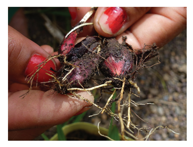
Fig. 3. The Makushi category of charm plants ("bina") revealed unexpected synergies between their phytochemistry and the phenomena of shamanism ("piai") and necromancy ("kanaima"). [Colour online.]

Matsigenka, a similar procedure involves putting hair, clothing, dirt from a footprint, or other personal possessions of a victim into contact with the caustic sap of Dieffenbachia or Hura crepitans to inflict an inflammatory sorcery illness.