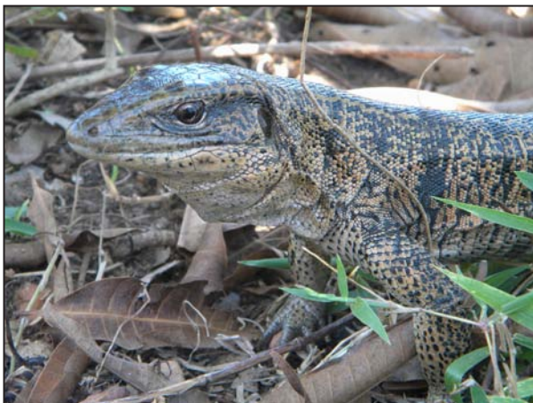
Figure 1. Adult specimen of Tupinambis teguixin (CHJJ 0666) from municipality of Barras, state of Piauí, Brazil.

Comments. — The genus Tupinambis Daudin, 1803 occurs in most part of South America east of the Andes, southward reaching northern Patagonian, in Argentina (Ávila-Pires 1995; Cei and Scolaro 1982). Contains four species: Tupinambis longilineus Ávila-Pires 1995, T. palustris Manzani and Abe 2002, T. quadrilineatus Manzani and Abe 1997, and T. teguixin (Linnaeus 1758) (Bérnils and Costa 2012). According to Ávila-Pires (1995), the species Tupinambis teguixin (Fig. 1) occurs in forests and open