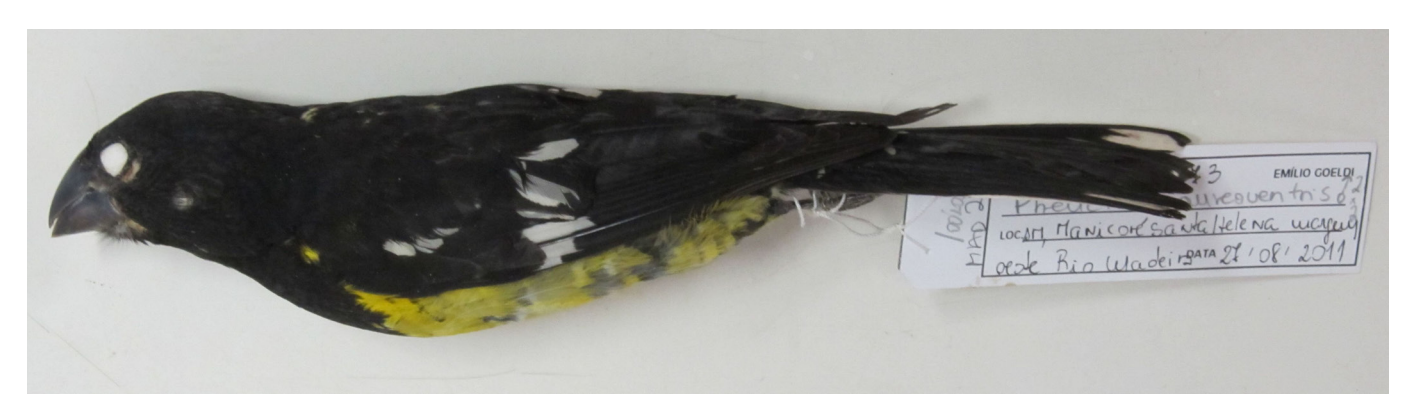
FIGURE 2. Male specimen of Pheucticus aureoventris (MPEG 73473) collected in the municipality of Manicoré, Amazonas, on 27 August 2011.

On 12 July 2012, G. A. S. and S. M. recorded one individual of P. aureoventris in the municipality of Rio Verde, state of Goiás (18°15'05"S; 50°51'06"W; 707 m altitude), on a slope covered with shrubby vegetation in a transitional region in southwestern Goiás dominated by savanna and both gallery and dry forests. This individual, a male, remained perched for about 2 minutes at the top